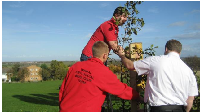
Grange Park, West Kirby

The Grange Park area of West Kirby saw environmental improvements led by the Friends of Grange Park residents' group with the planting of cherry trees and a lantern making workshop with children and young people. Tower Grounds in New Brighton saw local residents lead on an environmental audit with agencies. Work was undertaken in partnership with Leasowe Community Homes, taking the opportunity to speak with residents and young people attending the annual 'Unity in our Community' Halloween fancy dress party.